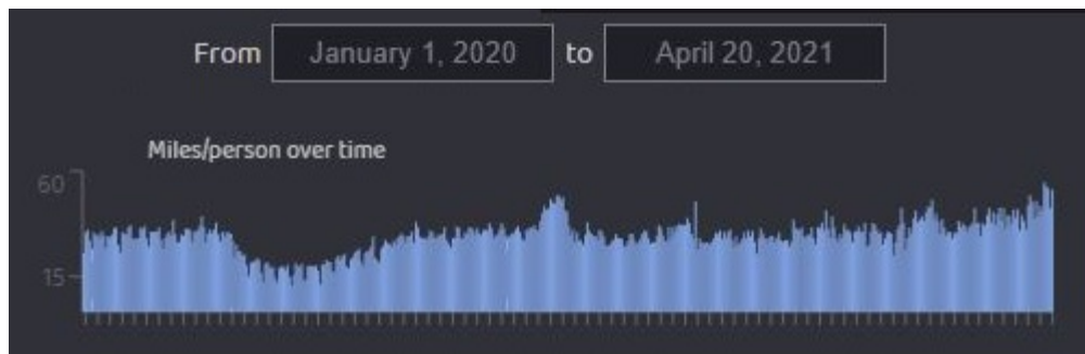
Miles per person from 1/1/2020 to 4/20/2021

Prior to the pandemic, the percentage of people staying home on weekdays was around 17%. This number spiked to around 35% in April 2020, which resulted in a substantial shift in cars on the road. Similarly, trips per person decreased from 3.5 trips per day to around 2.5 trips per day in April 2020. That number moved back to a normal range by July of 2020, however, and as of April 2021, has increased to over 4.0 trips per day. A similar trend can be seen in miles/person per day in Rhode Island, as dictated in the graphic below. These trends cause more irregular congestion on roadways, and while peak hour traffic still exists in 2021, it has become less predictable throughout off-peak hours.